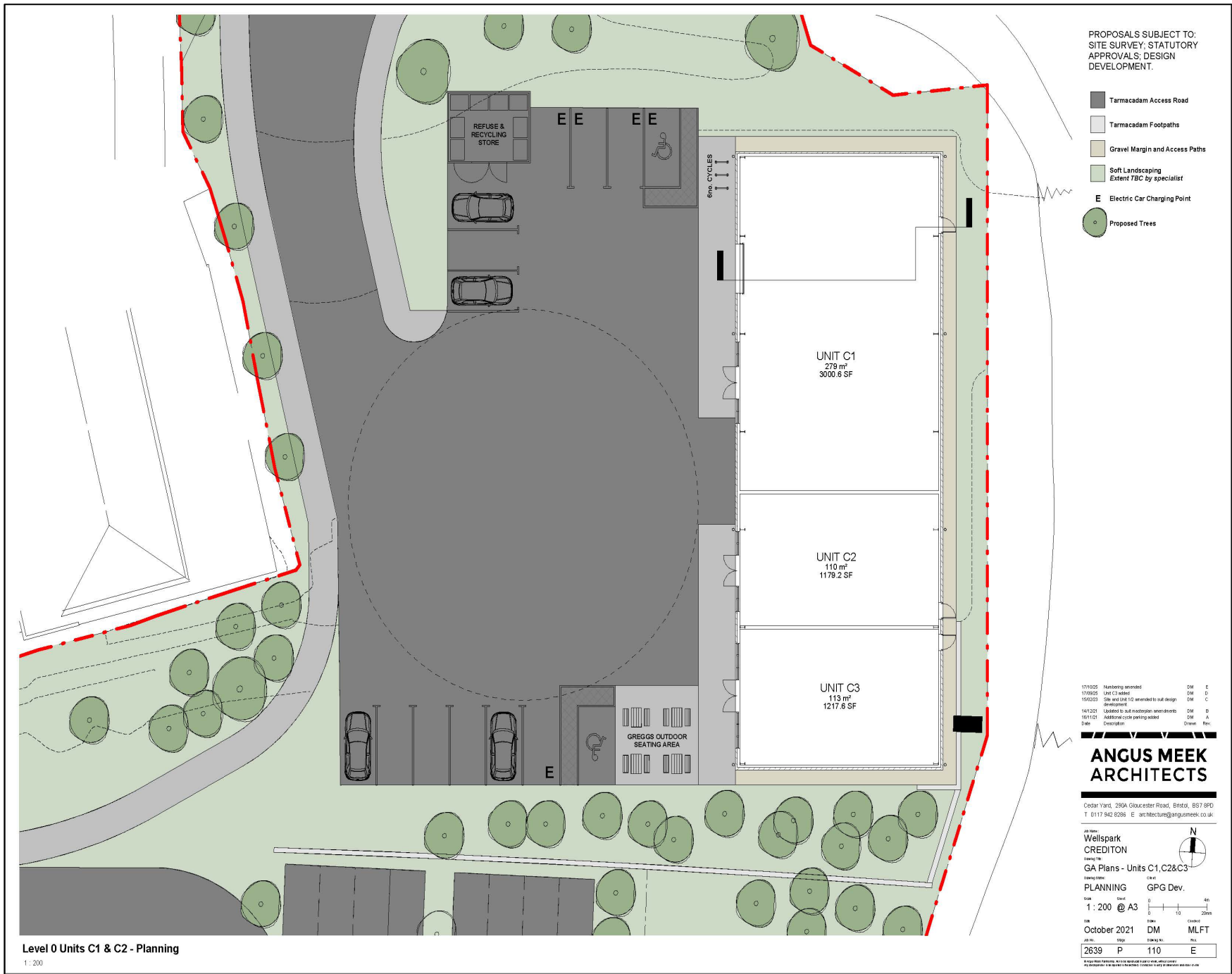
Level 0 Units C1 & C2 - Planning