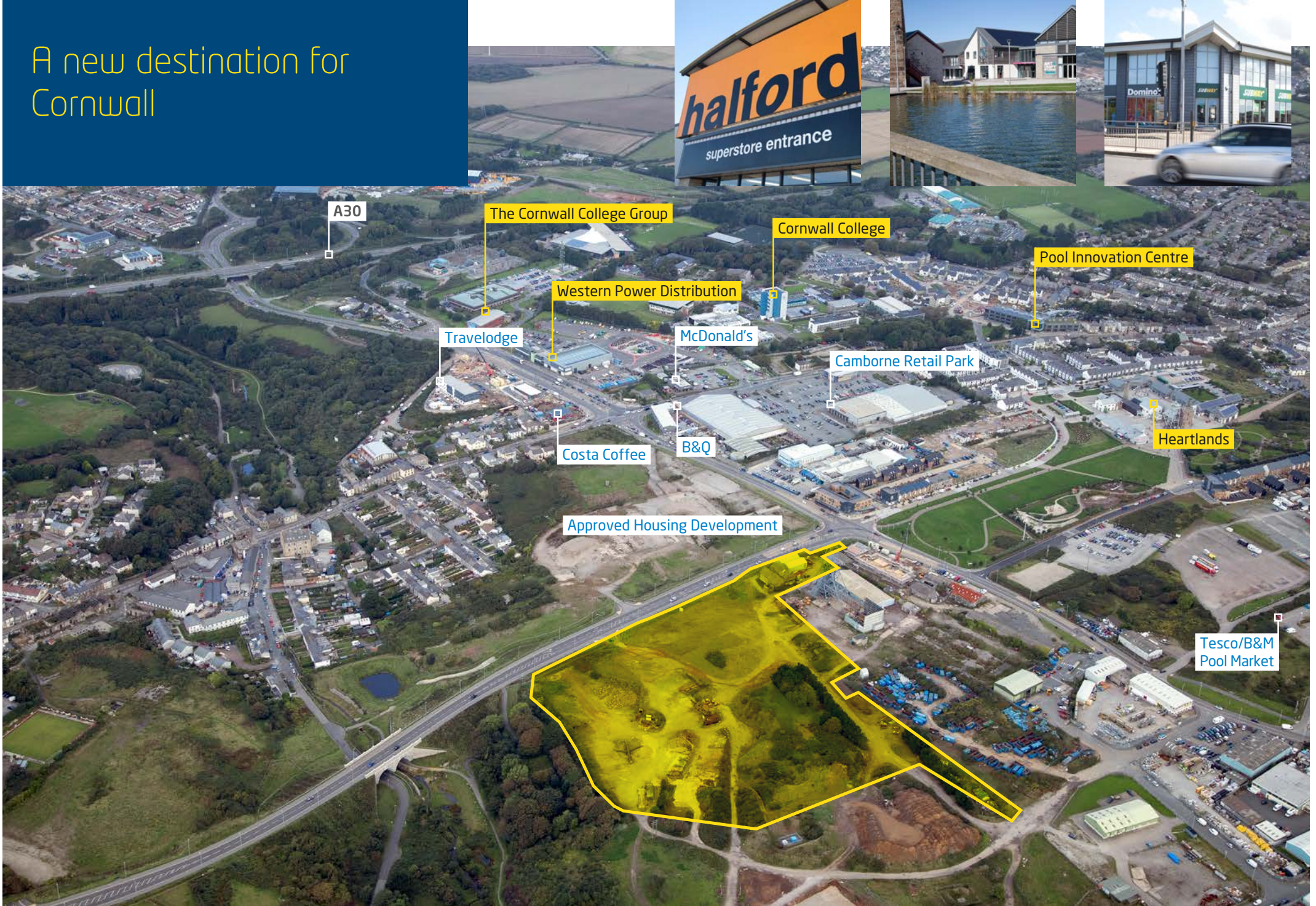
South Crofty Retail and Business Park Kerrier Way Pool Cornwall TR15 3QT