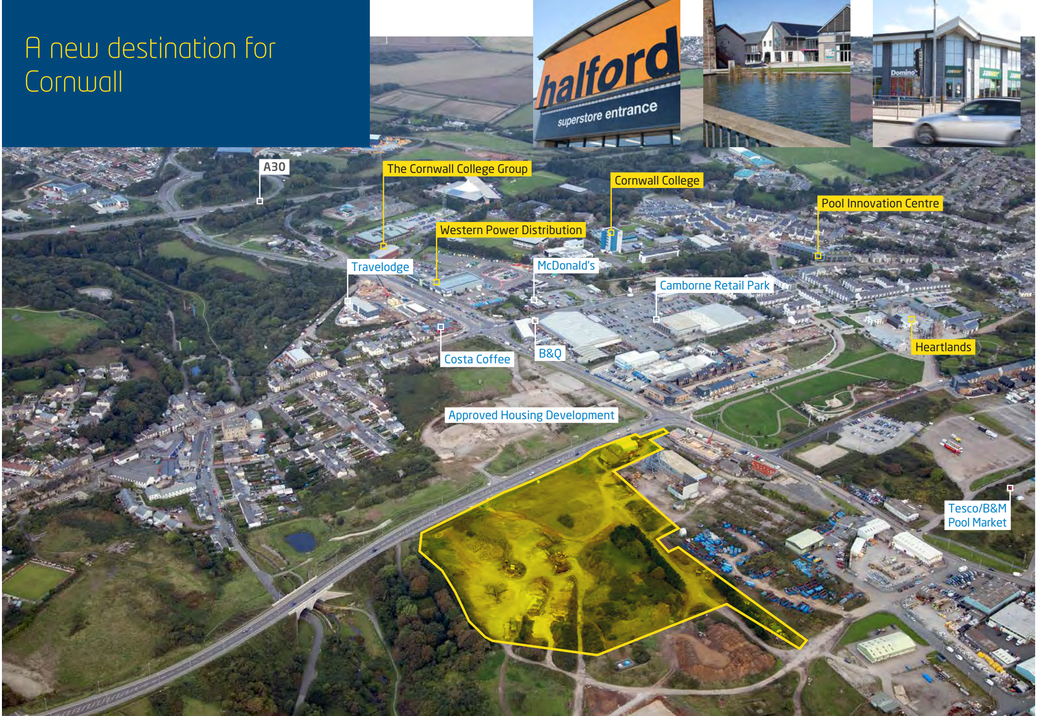
South Crofty Retail and Business Park Kerrier Way Pool Cornwall TR15 3QT